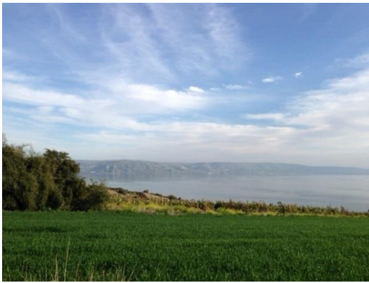
Image: Mount of Beatitudes overlooking the Sea of Galilee