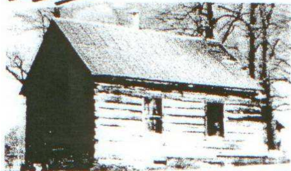
Photo of the first church taken in 1979